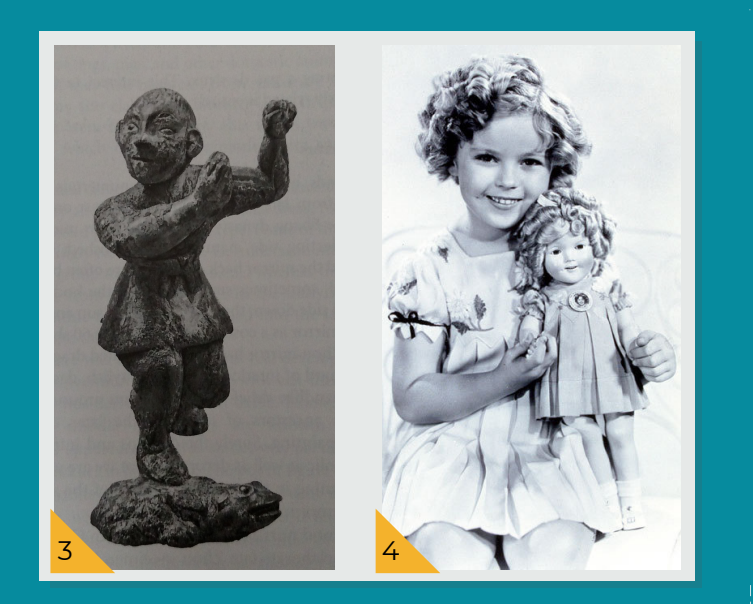
3. Boy on a toad, China, Late Zhou period (mid-900s CE). Bronze, height 4".

4. Shirley Temple with a doll in her likeness, ca. 1930s.