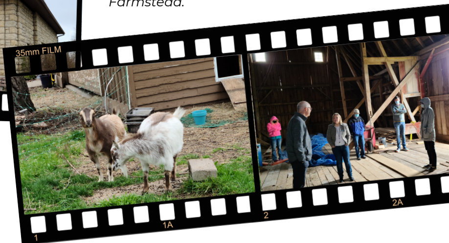
▼ Our tour of the farm was both informative and chilly.