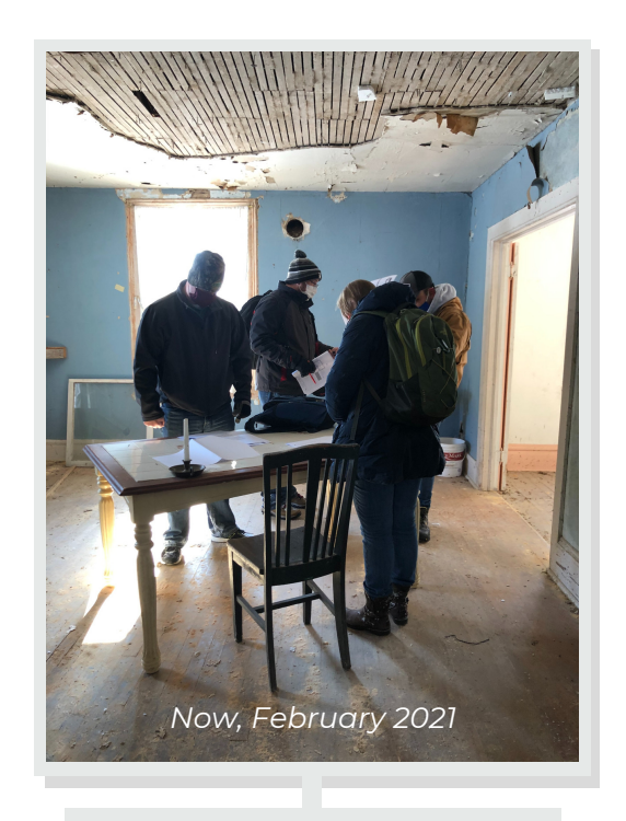
▲ The Miller Dunwiddie team assessing current deterioration in the Stoppel farmhouse.

Throughout the spring, the architects and engineers will be creating architectural drawings and construction documents for the farmstead. That work will include assessing current deterioration, from rotted joists to spalled stone and specifying appropriate repairs. We know that we want to use the farmstead for interpretive tours and programs but, though we aim to restore the buildings as close to their original state as possible, some modern amenities will be needed. Miller Dunwiddie will work with HCOC staff and board members in designing and placing utilities, lighting, restrooms, HVAC, smoke detection, security, etc. in the least intrusive way possible.