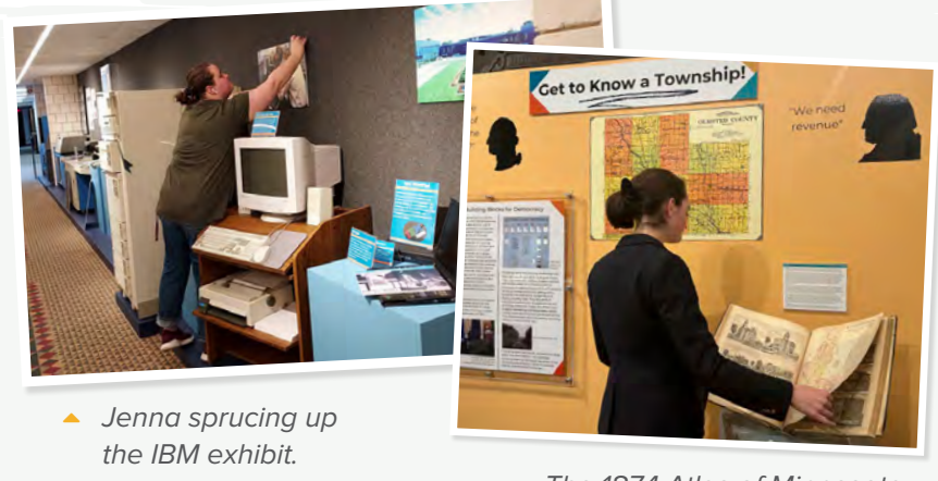
▲ The 1874 Atlas of Minnesota.

Spring seems to have come a little early, and with it, new updates to exhibits at the History Center! Our exhibit on the history of IBM in Rochester has been refreshed with new pedestals for artifacts, labels, and photographs. The large mural "Marking Broadway" in the exhibit hall also has new display information, and the original concept art that inspired the mural in the 1930s is now featured as well. Last but certainly not least, the Get to Know a Township exhibit has a new feature: Cascade Township!