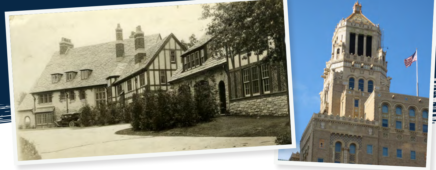
The Plummer House shortly after it was finished.