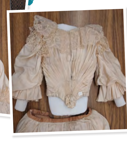
Edith Graham Mayo's restored wedding dress

Marriage has experienced many changes throughout history, but one piece has remained customarily untouched: the wedding dress. Characteristically, the bride chooses the dress for their special day. These dresses range in different styles, patterns, and even colors.